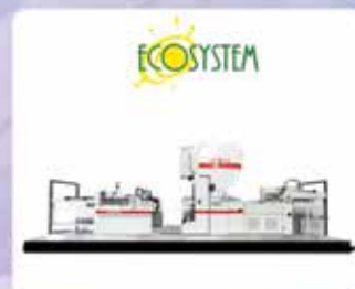
Aqueous & PUR lamination machines

Visit us at: PAMEX 2023 Stall No. MS-19, Hall No. 01