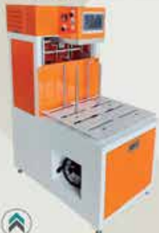
Semi Automatic Iron Sheet Pasting Machine