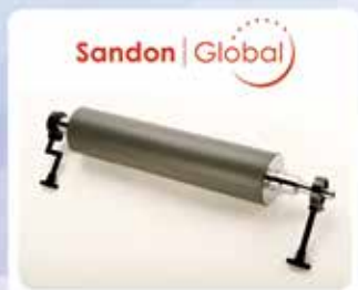
Narrow-web & Tactile Coating