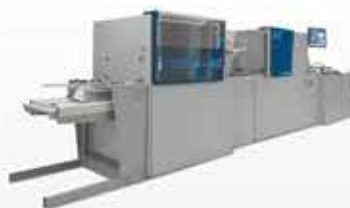
JV3DS Digital & Commercial Print