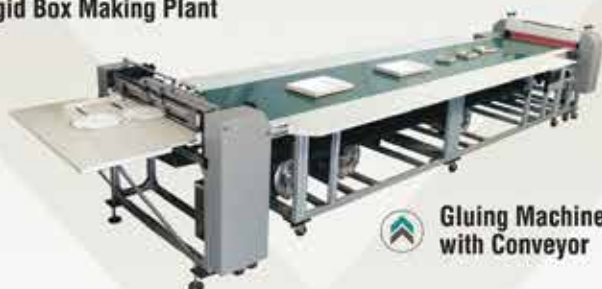
Gluing Machine with Conveyor