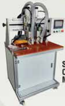
Semi Automatic Cardboard Drilling Machine

for Live Demo visit us at Hall No: 2, Stall No: H-50