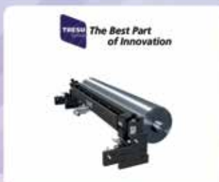
Chamber & Doctor Blade Systems