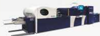
JV3D EVO Packaging & Commercial Print