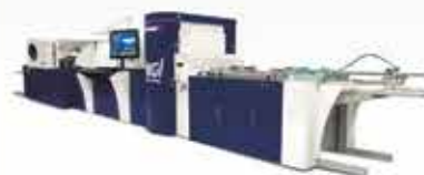
3D 52L Commercial Print