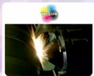
Anilox Rollers for offset industry