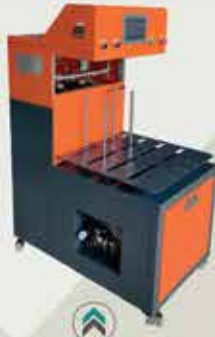
Semi Automatic Magnet Pasting Machine