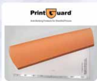
Transfer Cylinder Jacksts & Sheets