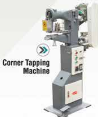
Corner Tapping Machine