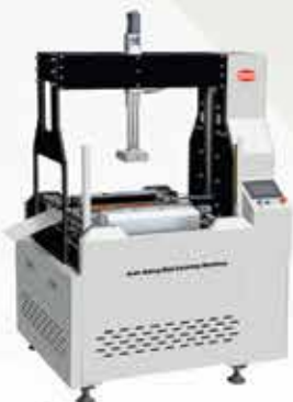
Box Forming Machine