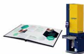
Unifoil Printer & Vpaper Tower

Visit us at: PAMEX 2023 Stall No. MS-19, Hall No. 01