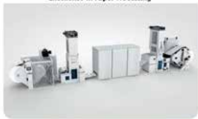
Digital Paper Processing Machines for Rolls

hunkeler rIP Excellence in Paper Processing