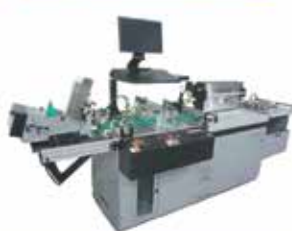
Card Attaching & Paper Processing Machines

Kirk-Rudy Innovation in digital printing and product handling solutions