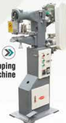
Corner Tapping Machine