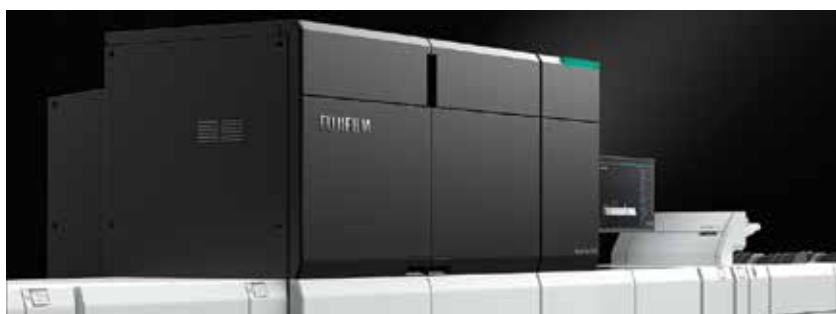
FUJIFILM Revoria Press PC1120