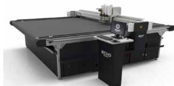
IECHO TK 3 Series Digital Cutter

be installed to showcase the cutting capabilities for paper, board, corrugated, films, etc.