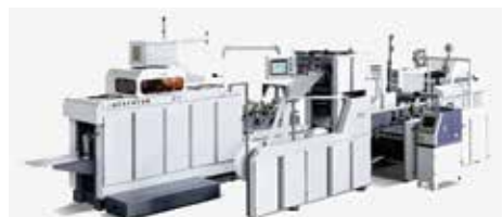
NBG square bottom paper bag machine

We will also be displaying our upgraded wide format printers like iPF TM, TZ & GP Color Series, along with the recently launched iPF TC series at Stall No B10, Hall No 1 (180 Square Meter).