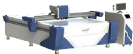
Mehta Flatbed Digital Cutter