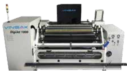
DigiJet wide-format digital printing system