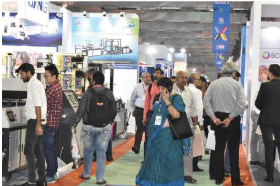
The 2017 edition of the Pamex exhibition witnessed an unprecedented 25, 223 unique visitors.

Few leaders from the industry who have already marked their presence in the exhibition are Acme Machinery, Advanced Graphic Systems, Ample Graphics, APL Machinery, Autoprint Machinery Manu-