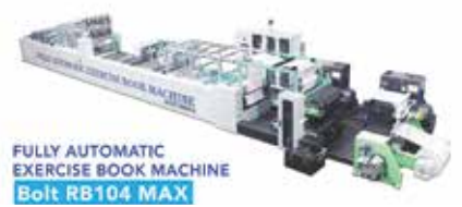
FULLY AUTOMATIC EXERCISE BOOK MACHINE Bolt RB104 MAX

Line O Matic is launching new variant in Bolt RB Series i.e. Bolt RB104 MAX - fully automatic exercise book machine, having speed of 500